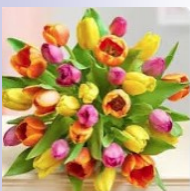
Spring has Sprung!